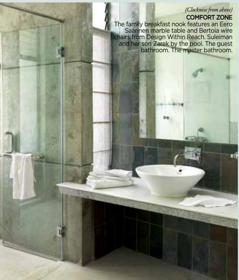
(Clockwise from above) COMFORT ZONE The family breakfast nook features an Eero Saarinen marble table and Bertoia wire chairs from Design Within Reach. Suleiman and her son Zarek by the pool. The guest bathroom. The master bathroom.